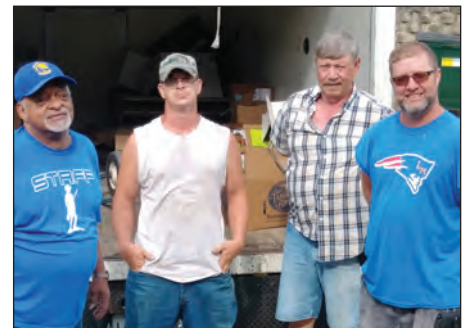
Lafayette County Enterprises in Higginsville has several new contracts, including a recycling partnership with the Lexington R-V School District.