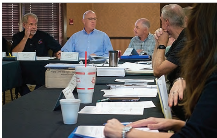
Members of the MASWM Board of Directors are meeting or holding conference calls at least monthly in order to keep up with challenges facing workshops.